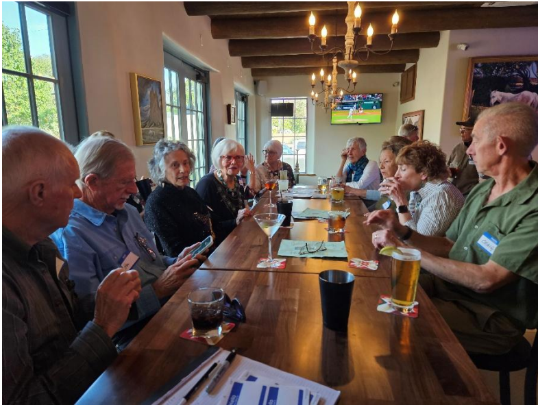
Last October's happy hour at Sandia Bar drew roughly 25 Compadres.